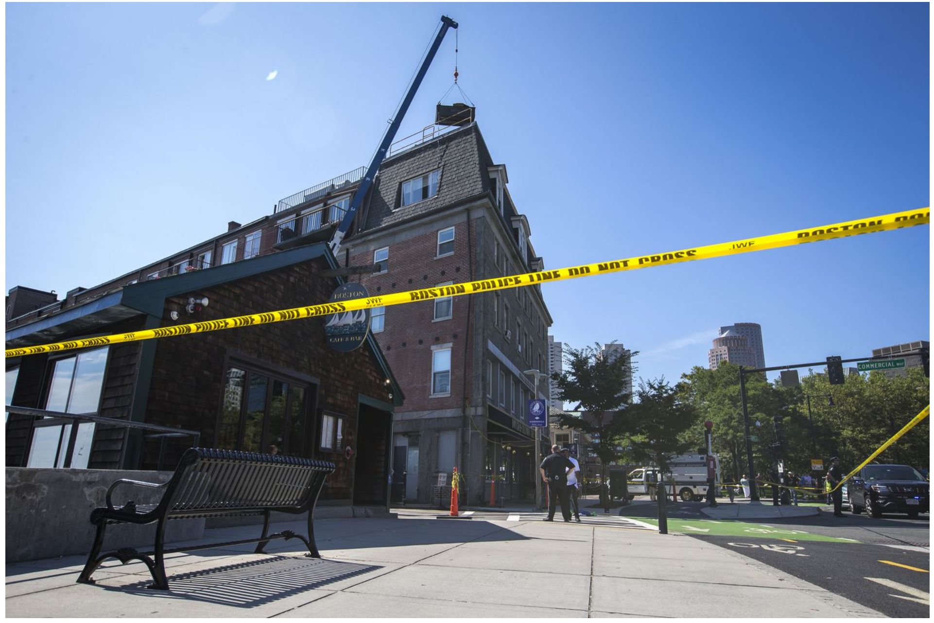
An overall view where police investigated the scene where debris fell from a structure and struck a woman in the North End on Thursday.